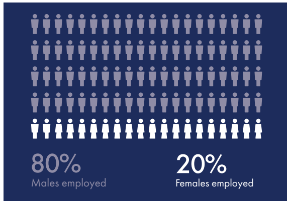
Percentage of males and females employed

We are confident that men and women are paid equally for doing the same job at Hendy Group. However, as with previous years, there is a greater proportion of men than women in senior roles, which in turn creates a gender pay gap.